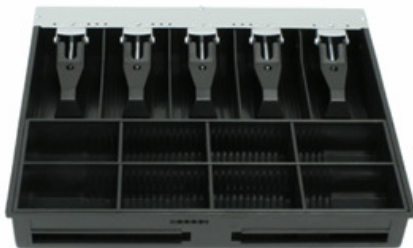
Insert – 5 notes / 8 coins Insert – 8 notes / 8 coins Insert – 7 notes / 8 coins