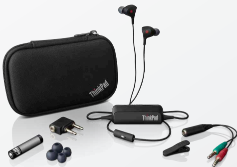
The ThinkPad® Noise Cancelling Earbuds