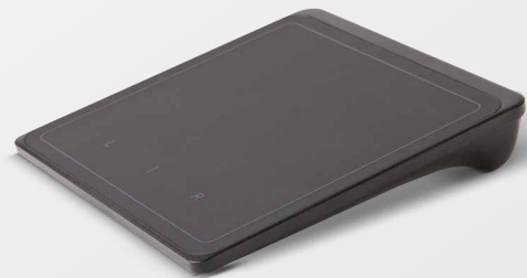
Lenovo® Wireless TouchPad for Windows 8