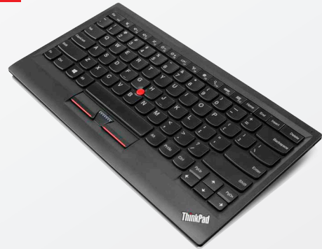
ThinkPad® Wireless Bluetooth® Keyboard with TrackPoint®