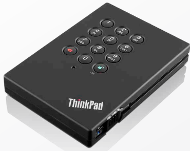
ThinkPad® USB Secure Hard Drive