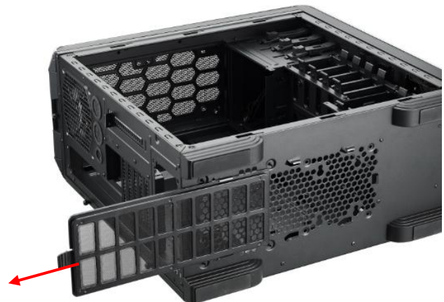
Multiple dust filters (top, front, bottom)