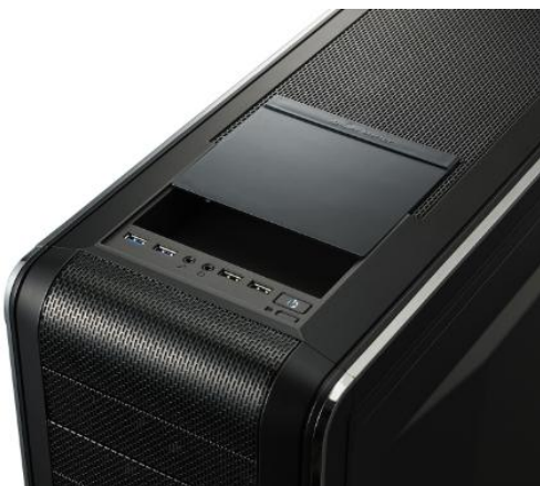
Top compartment and I/O are protected by a cover