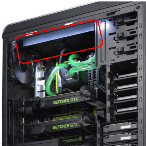
Supports a 240mm radiator at the top