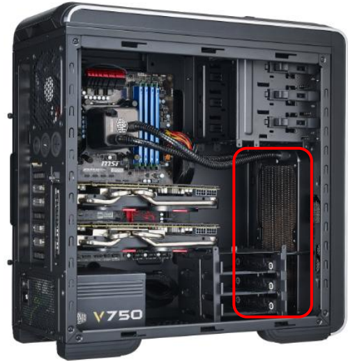
Supports a 240mm radiator in the front (the HDD/SSD combo cage should be removed)