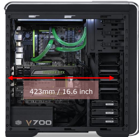
Supports high-end graphics cards up to 423mm/16.6"