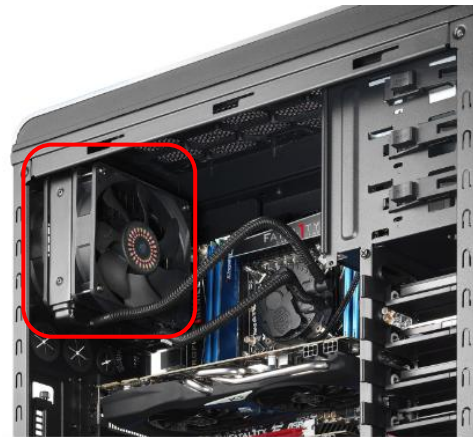
Supports a 120mm radiator in the rear