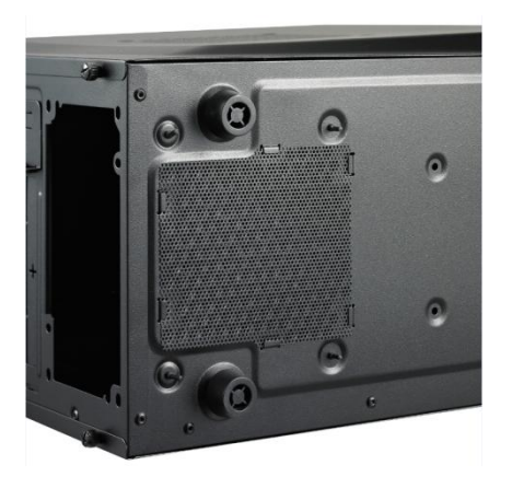
Washable dust filter under PSU