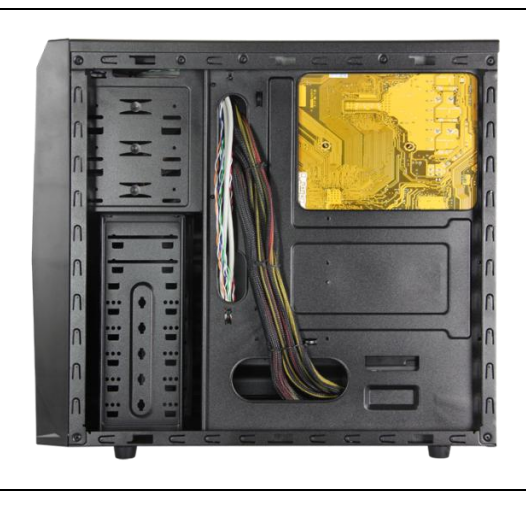
Large space for cable routing