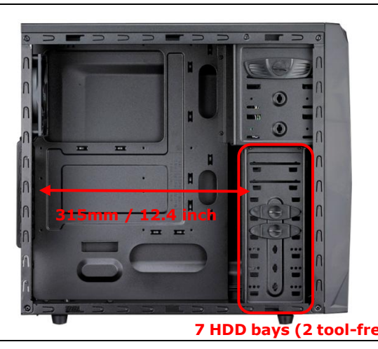
Supports long graphics cards