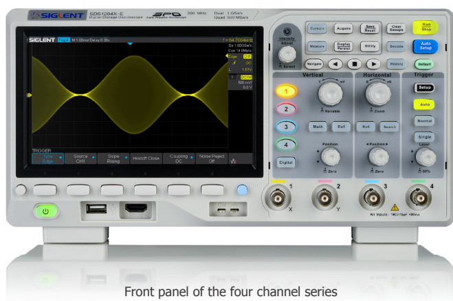
Front panel of the four channel series