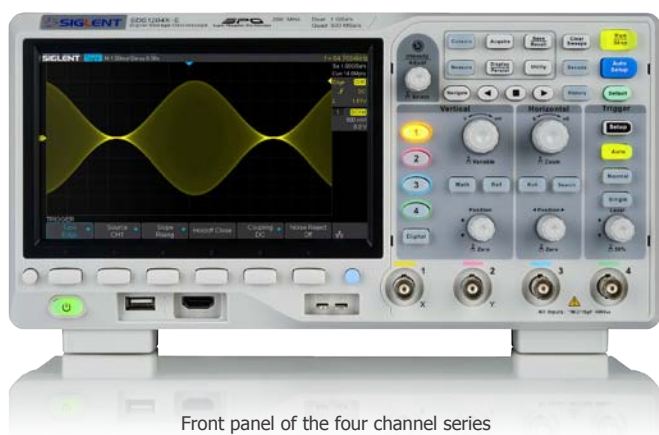
Front panel of the four channel series