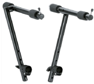
18941 Stacker - black