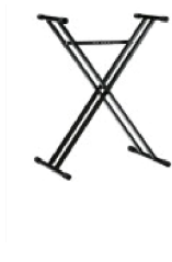
18963 Keyboard stand - black