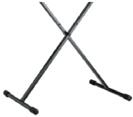
18962 Keyboard stand - black