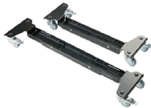
18806 Trolley for Keyboard Stands - black