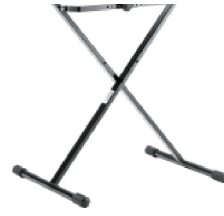
18969 Keyboard stand for kids - black