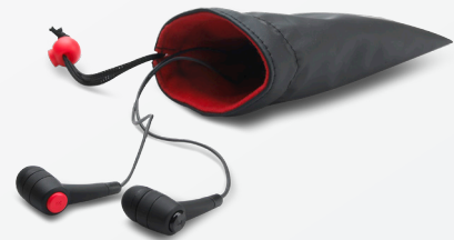
ThinkPad® In-ear Headphones (57Y4488)