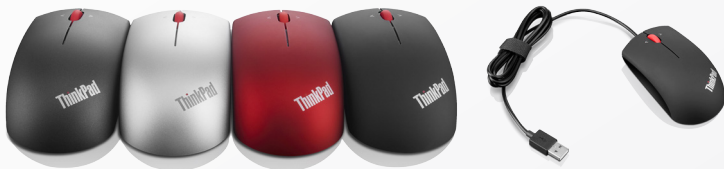
ThinkPad® Precision Wireless/USB Mouse (0B47163, 0B47153)