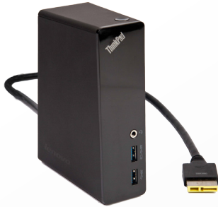
ThinkPad® OneLink black Dock (4X10A060xx) 4