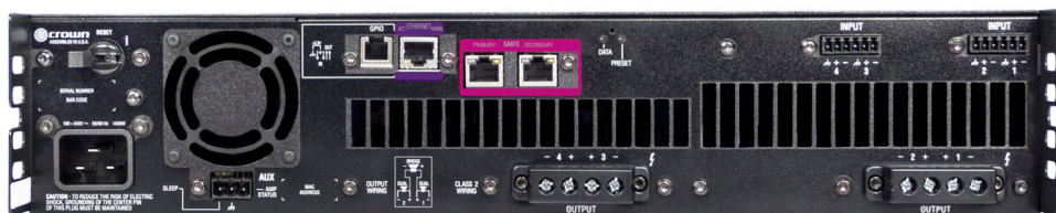
4|1250DA model shown