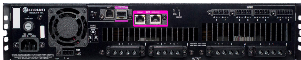
8|300DA model shown