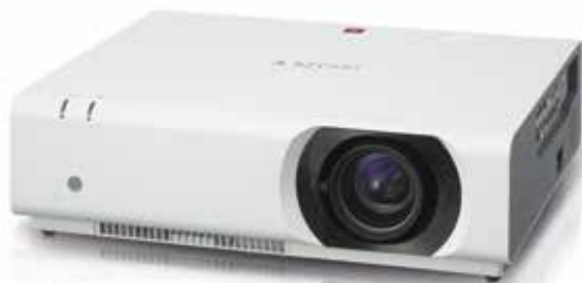
VPL-CH350, VPL-CH355, VPL-CH370 & VPL-CH375

When it comes to equipping medium to large-sized classrooms or meeting rooms, cost is critical. The VPL-CH350, VPL-CH355, VPL-CH370 & VPL-CH375 are a cost-effective choice with no compromise on picture quality.