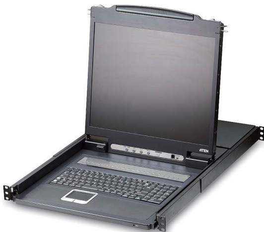
CL1316 Front view