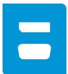
Ports: DisplayPort, VGA