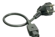
EXTL100-02 (Schuko plug)