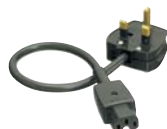
EXTL100-02 (UK plug)