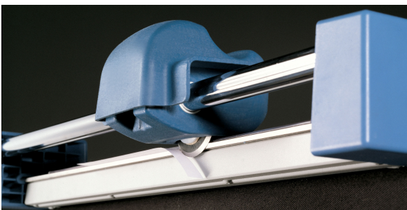
Special sharpened carbon steel blade to cut high thickness of paper