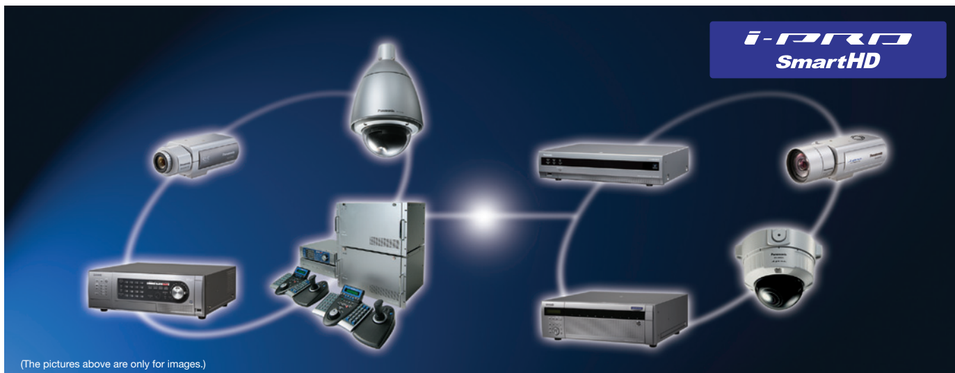
(The pictures above are only for images.)