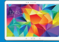
Galaxy Tab® S 10.5"