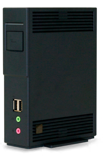
7020-P45 zero client Ultra-powerful PCoIP zero client with up to four HD displays.