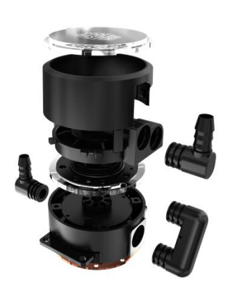
Exclusive dual chambers design to improve the performance and lifespan of pump