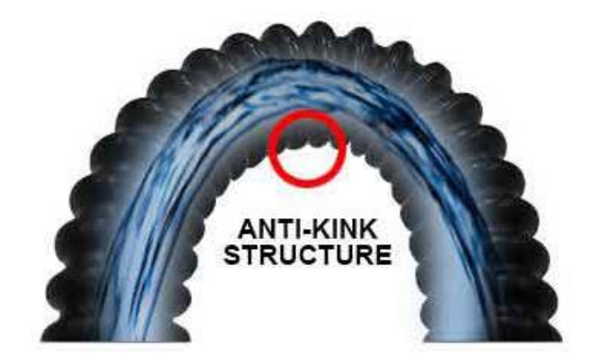
The FEP tubing allows maximum, unrestricted waterflow and decreased evaporation rate for greater durability