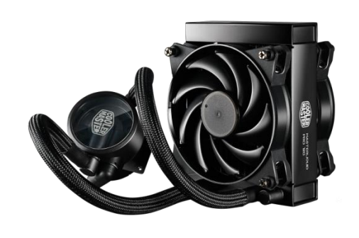
MasterFan Pro 120 Air Balance with perfect balance of noise and performance