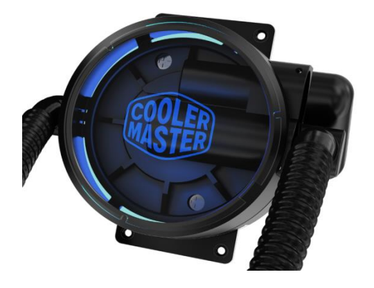
Elegant blue LED illumination on the top of water block