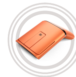
Lenovo™ N700 Wireless Mouse