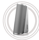
Lenovo™ 500 Bluetooth® Speaker