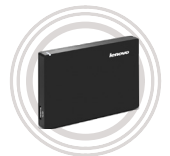
Lenovo™ UHD F308 1 TB