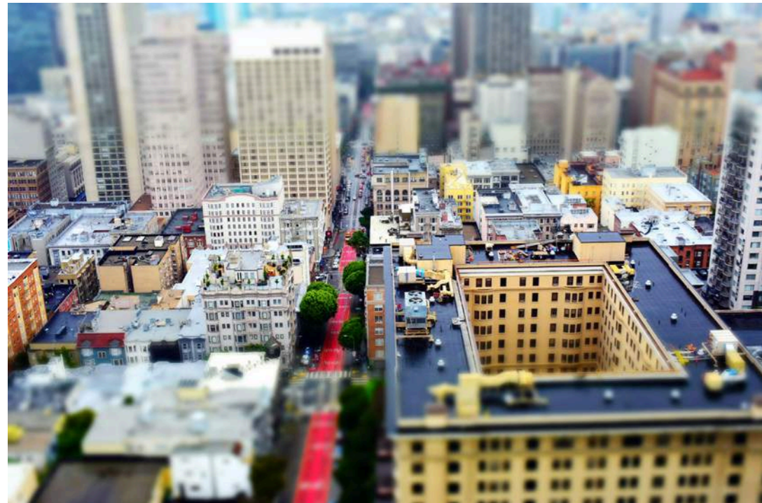
Special effects: Miniature effect