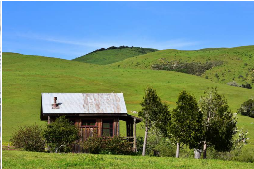
Scene mode: Landscape