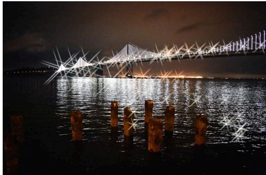
Retouch menu: Filter effects (Cross screen)