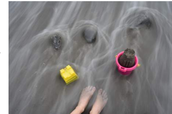
Guide mode: Show water flowing

*1 Movies shot in this mode play back like a slide show made up of a series of stills. *2 Movies shot in this mode play back at high speed. Sound is not recorded with movies. The built-in flash and AF-assist illuminator turn off.