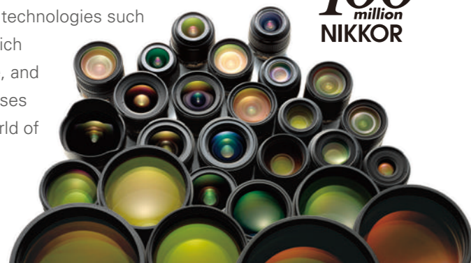
Image quality depends on the performance of the lens. Thanks to the advanced optical and production technologies accumulated over the years, all NIKKOR lenses, including kit lenses, achieve excellent image reproduction at high resolutions. Nikon has implemented cutting-edge technologies such as Vibration Reduction (VR) which compensates for camera shake, and the wide variety of NIKKOR lenses lets you enjoy a whole new world of creative expression.