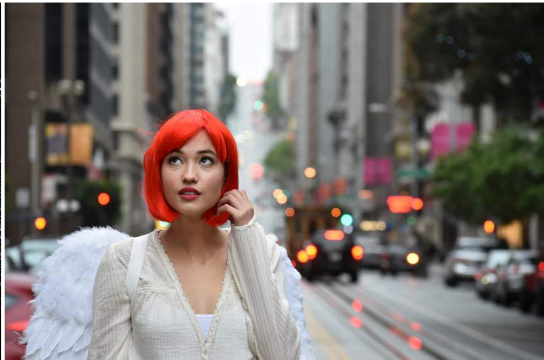
Guide mode: Soften backgrounds