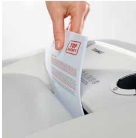
Innovative MHP technology® shreds up to 30 % more paper