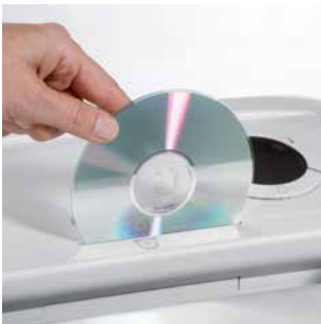
Separate feed opening for CDs, DVDs, cheque and credit cards guarantees reliable shredding of optical, magnetic and/or electronic data carriers