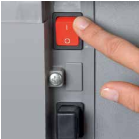
Separate main switch is located on the rear of the document shredder and completely disconnects it from the mains power supply