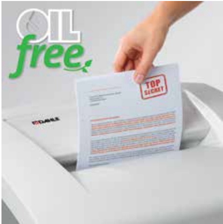
Shredding the convenient way, all without the time-consuming process of oiling the cutters