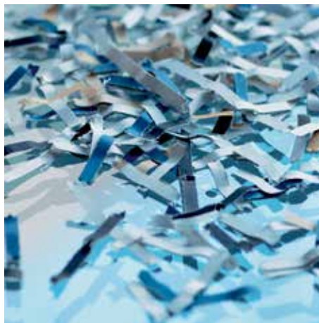
P-4 security: recommended, for example, for data media containing particularly sensitive, confidential and personal data