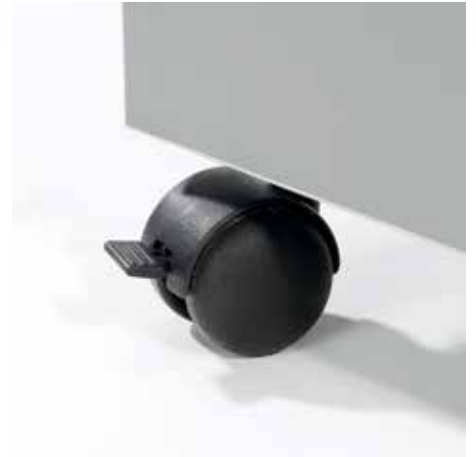
Practical swivel casters for flexible use