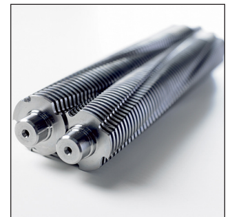
In order to provide slip free power to the cutting cylinders, a steel chain & gears connect the two for maximum capacity.