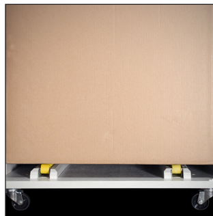
Conveyor of rollers on each side allows for easy removal of the 50 gallon waste container.