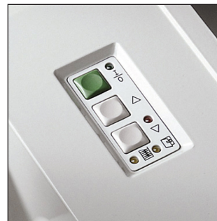
The electronic control panel allows for auto on/off, continuous run, and reverse operation.