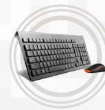
Lenovo Professional Wireless Combo