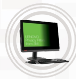
Lenovo Privacy Filter for ThinkCentre AIO from 3M