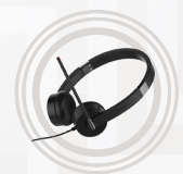
Lenovo Stereo Headset