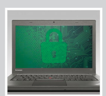
SIMPLIFIED USABILITY Intel® vPro™ makes security and management simple and easy