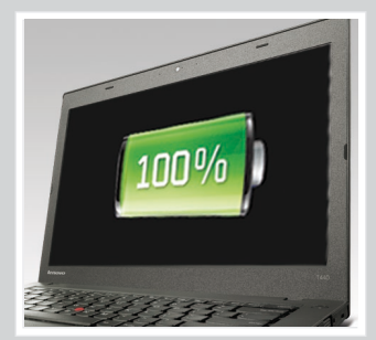
LONG-LASTING PERFORMANCE More than 10 hours of battery life