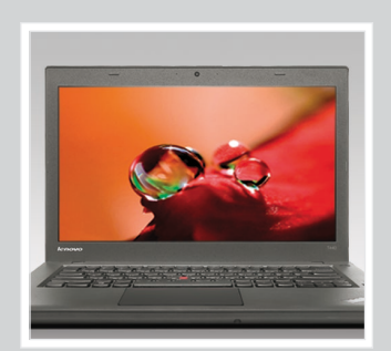
SUPERIOR DISPLAY 14" HD, HD+ screen with multitouch capability and Full HD display options, for clear and sharp visuals