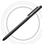
ThinkPad 10 Digitizer Pen