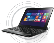
ThinkPad 10 Ultrabook Keyboard