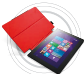
ThinkPad 10 Quickshot Cover