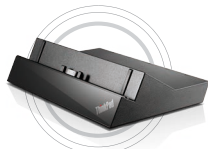
ThinkPad 10 Tablet Dock