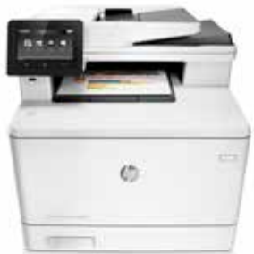
HP Color LaserJet Pro MFP M477fdw