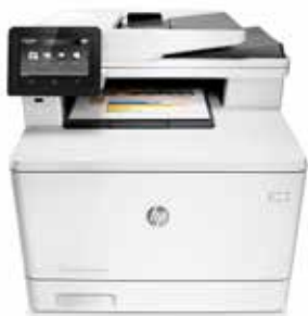
HP Color LaserJet Pro MFP M477fnw

Unmatched print, scan, copy, and fax performance plus robust, comprehensive security for how you work. This colour MFP finishes key tasks faster and guards against threats. 1 Original HP Toner cartridges with JetIntelligence produce more pages. 2