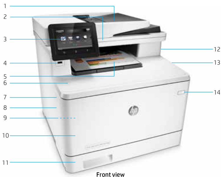
HP Color LaserJet Pro MFP M477fdw shown