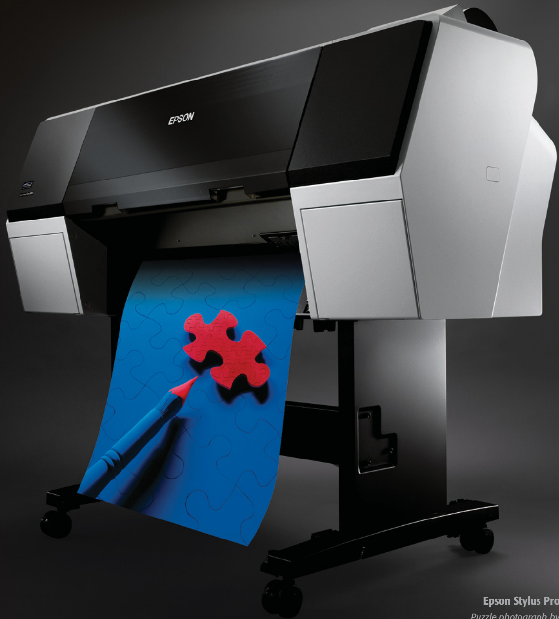
Epson Stylus Pro 7900 – 24" Puzzle photograph by Jeff Schewe