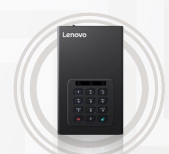
Lenovo Secure Desktop Hard Drive