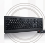
Lenovo Professional Wireless Keyboard & Mouse Combo