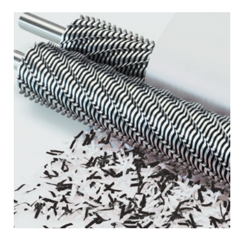
SOLID STEEL CUTTING SHAFTS Robust and durable: high-quality paper clip proof cutting shafts with lifetime guarantee under conditions of fair wear and tear.