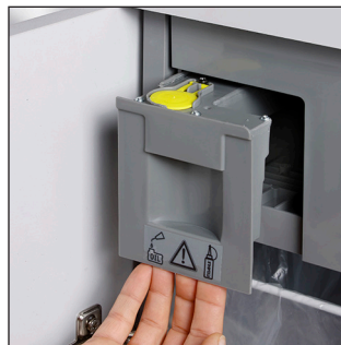
Built in EvenFlow Lubrication System evenly lubricates the cutting cylinders reducing the risk of a paper jam.