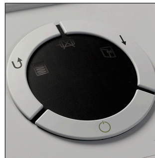
The easy-to-use command dial controls all of the shredder's functions such as power up, reverse, and continuous run.