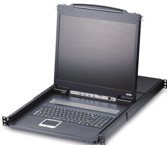
CL1316 Front view